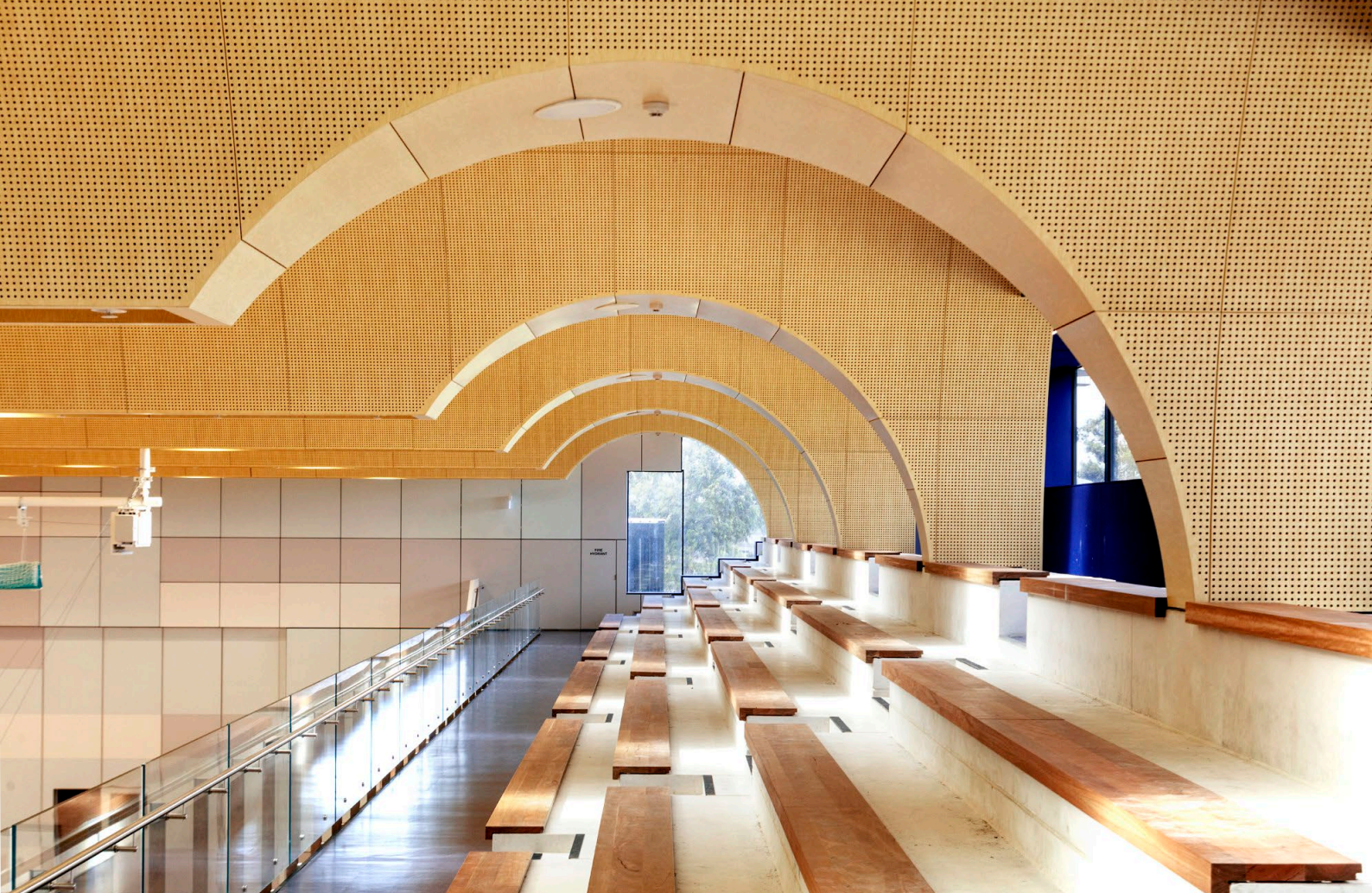
Penleigh and Essendon Grammar School (PEGS) Complex curved acoustic ceiling brings design dreams into reality for school hall